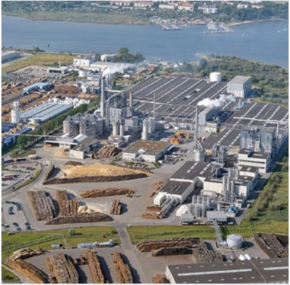
The area of 900,000 m<sup>2</sup> in Wismar is accessible via road rail or sea route

During the assembly, integration of the LTW components into the existing system produces a few surprises – but in close cooperation with the LTW headquarters in Wolfurt these