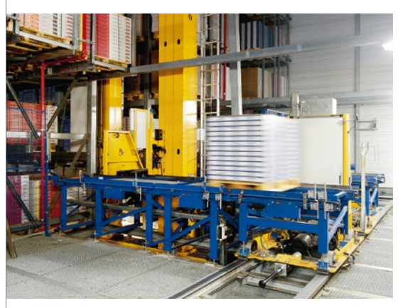
EGGER pallet warehouse with five stacker cranes and complex conveyor system – approved LTW quality in the project phase as well as in long-term usage.

With focus on maximum safety on the one hand and costs on the other hand, LTW plans the kinetic values as cautiously as the required performance allows. Approved components, such as the six-tine telescopic fork and the rail system are taken on from the existing apparatus.