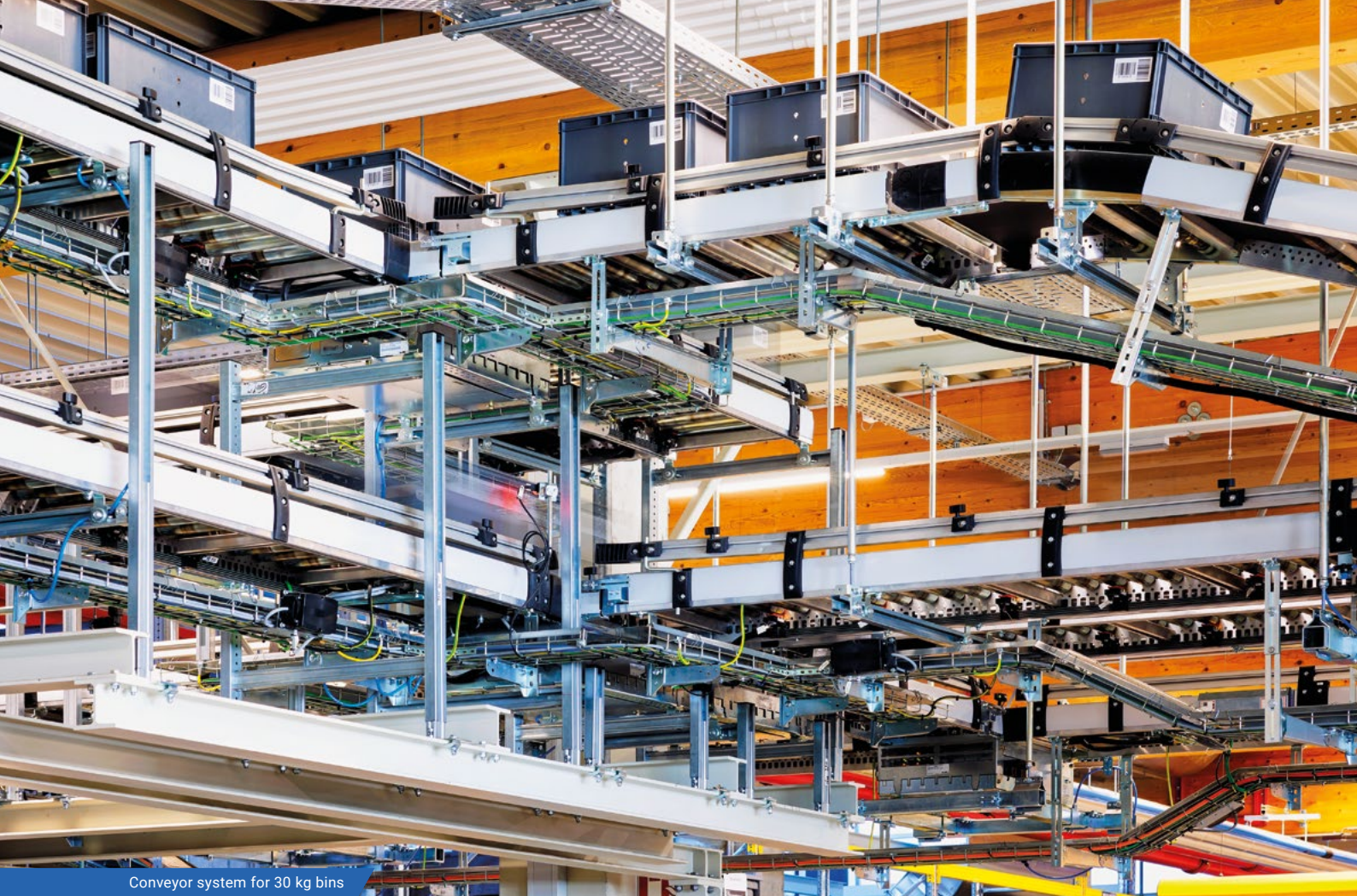
Conveyor system for 30 kg bins

conveyor technology must also be up to the job: 18 goods-in stations, 16 picking stations, 20 packing stations, and 9 vertical conveyors meet these requirements.